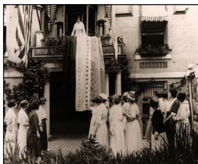
Alice Paul unfurls the ratification flag from NWP headquarters after Tennessee becomes the 36 th state to ratify 19 th Amendment. August 18, 1920. About this image

Government officials found it increasingly difficult to refuse the vote to women who were contributing so much to the war effort. Antisuffragist arguments about women’s mental and physical inferiority were difficult to sustain as women took over jobs vacated by men drafted into military service. In addition, the NWP’s militant tactics and the public support its members garnered from their imprisonment, combined with persistent, low-key lobbying, eventually forced President Wilson to endorse the 19 th Amendment on January 9, 1918. The next day, it passed in the House of Representatives.