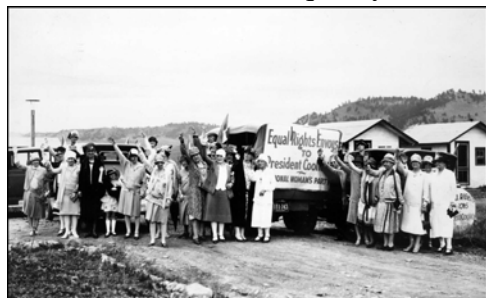
NWP envoys, comprised mostly of western women, motor to Rapid City, South Dakota, to meet with a vacationing President Calvin Coolidge and ask his support of the Equal Rights Amendment pending in Congress. July 1927.

Throughout the 20 th century, the NWP remained a leading advocate of women's political, social, and economic equality. In the 1920s, the NWP drafted more than 600 pieces of legislation