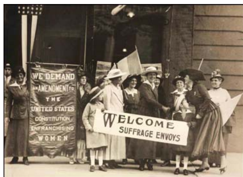
Suffrage envoys from San Francisco greeted in New Jersey on their way to Washington to present a petition to Congress containing more than 500,000 signatures. November-December 1915.

From 1914 to 1917, the CU, with its national headquarters in Washington and state branches throughout the country, instilled in the flagging American suffrage campaign an energy and militancy reminiscent of the early radicalism of Stanton and Susan B. Anthony (1820-1906). CU members held street meetings, distributed pamphlets, organized elaborate parades and pageants, heckled candidates, collected signatures on suffrage petitions, mounted billboards on public highways, and orchestrated coast-to-coast automobile and train tours of suffrage speakers. The CU also arranged for deputations of women to meet with the president, encouraged western women already enfranchised to vote as a bloc in the 1914 congressional and 1916 presidential elections, and kept an extensive card index file on every member of Congress as an aid in its relentless lobbying effort. All of its tactics were designed to generate interest and publicity, attract new supporters, and pressure public officials.