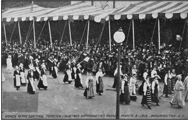
Contingent of women representing foreign countries in the March 3, 1913, suffrage parade in Washington, D.C.

Their first activity on NAWSA's behalf was to organize a massive national suffrage parade in Washington, D.C., in March 1913.