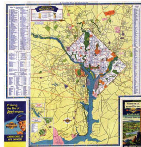
Rand McNally. Washington, D.C. and Metropolitan Area, Sunoco Road Map . Chicago : 1950. This is one of 16,000 maps from the Peterson Road Map Collection.