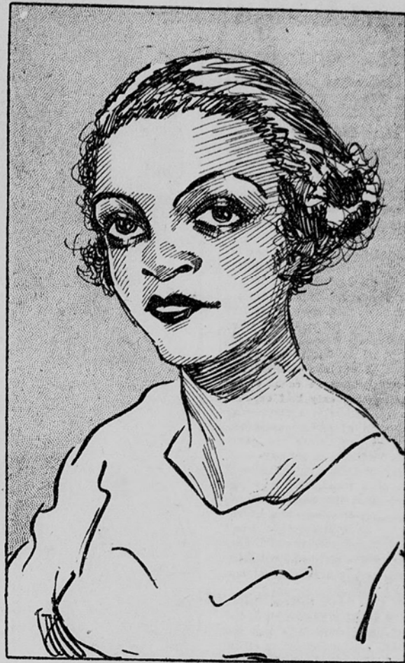
Florence Mills, "coloratura" with "The Plantation Revue." She is the bright spot of the piece and with her six Dixie Vamps can put a Tired Business Man on his feet for an entire week without sleep.