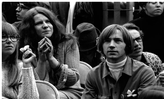
Janis Joplin and Peter Tork of the Monkees at Monterey Pop

When Ravi Shankar came out on-stage, he asked the crowd not to smoke and to close their eyes and go with the flow. And, they did. Even the artists playing the festival went out into the crowd to watch Ravi Shankar perform. A lot of people had never heard Indian music, and Ravi was the master.