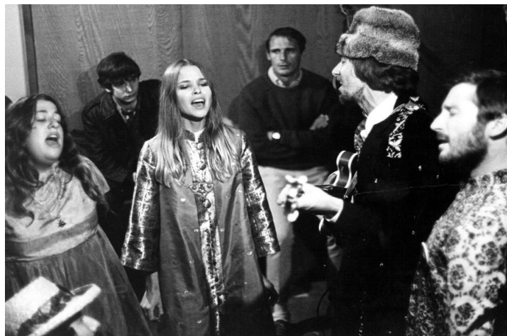
The Mamas & the Papas warming up backstage at Monterey Pop

The Library of Congress spoke with Michelle Phillips, the only remaining member of The Mamas & the Papas, in April 2021 about her experiences with the film and the legendary concert event.