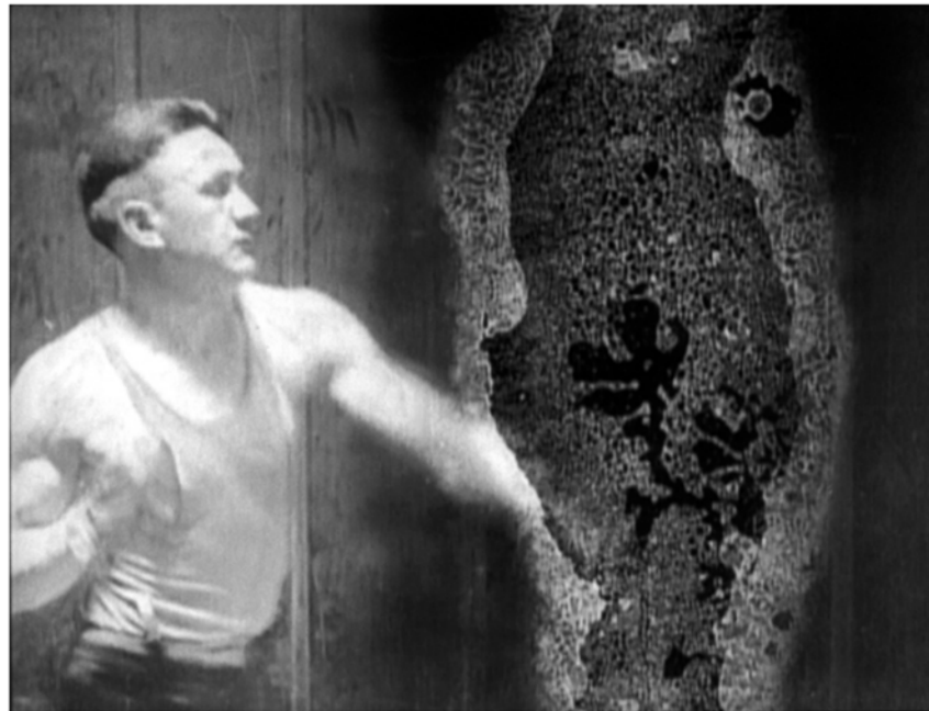
Willie Ritchie in a 1927 Fox Movietone newsreel

December 23, 2015 - 6:13 pm | Film Festivals, Silent Film, Special effects