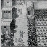
Bry, Theodor de. "[Village of Secotan.]" Print. [1590.] From Library of Congress Prints & Photographs Online Catalog.

http://loc.gov/pictures/item/2001695723/