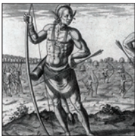
Bry, Theodor de. "[A Weroans, or Chieftain, of Virginia.]" Print. [1590.] From Library of Congress Prints & Photographs Online Catalog.

http://loc.gov/pictures/item/2001696968/