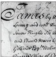
" Charter for the Virginia Company of London, 1606. " 1606. From the Library of Congress, The Thomas Jefferson Papers Series 8. Virginia Records Manuscripts. 1606-1737. Page 4.

http://loc.gov/pictures/item/2001696971/