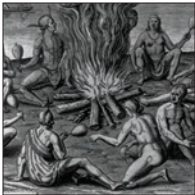
Bry, Theodor de. "[Praying Around the Fire with Rattles.]" Print. [1590.]