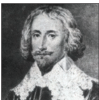
"[Virginia 1606]." May 28, 1904. Photo. From Library of Congress Prints and Photographs Online Catalog.

http://memory.loc.gov/cgi-bin/ampage?collId=mtj8&fileName=mtj8page062.db&recNum=3