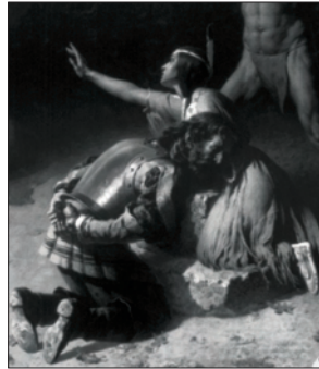
Pocahontas saving Captain John Smith from execution http://www.loc.gov/pictures/item/2005691455/

Chief Powhatan supplied the English with food, which likely prevented the settlement from collapsing altogether, but only about 40% of the settlers had survived the harsh winter when additional colonists arrived at the beginning of 1608. John Smith was among the colonists who secured food, and thus the colony, through trade and exploration. During 1607, he devoted his energies to repelling attacks and also explored and mapped the area. In December, he was captured and taken to Chief Powhatan. The chief released him on friendly terms after four weeks. Smith later claimed that this was by the efforts of Powhatan's daughter, Pocahontas, but there is no evidence to support the claim.