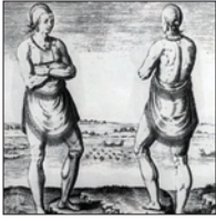
Bry, Theodor de. "[A Chief of Roanoke.]" Print. [1590.]