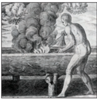
Bry, Theodor de. "[How They Build Boats.]" Print. [1590.]