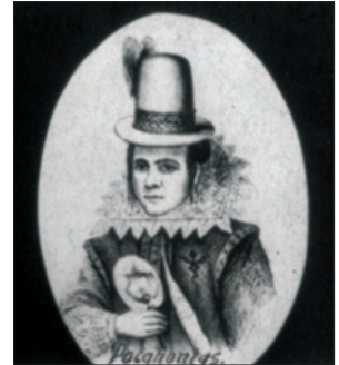
Virginia 1606

How does this information compare to what you know from other sources?