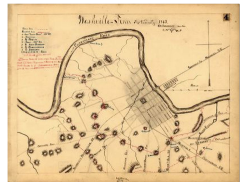
Nashville—Tenn. and vicinity 1863/ G.H. Blakeslee, Topo Eng. Geography and Map Division. Library of Congress

http://www.loc.gov/teachers/tps/journal/civilwar/pdf/ElementaryLevelLearningActivity.pdf