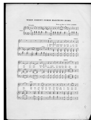
When Johnny comes marching home / Louis Lambert [notated music]. 1863 Performing Arts Encyclopedia. Library of Congress.

Have students use the musical expressions of the 1860s as primary sources to explore the meaning and values of that time for America compared with those of the 21st century. Civil War Music , a set of Library of Congress primary sources on this topic, offers background information and teaching ideas along with PDF versions of sheet music and other formats.