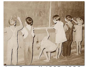
Children at the blackboard. Lake Dick Project, Arkansas

To access links to resources cited above visit the online version of this issue of The Teaching with Primary Sources Journal at http://www.loc.gov/teachers/tps/journal .