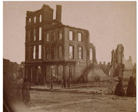
View in the "Burnt District," Richmond, Va., showing two women dressed in black approaching shell of four-story building, gutted by fire [1865]

http://www.loc.gov/teachers/tps/journal/civilwar/pdf/SecondaryLevelLearningActivity.pdf