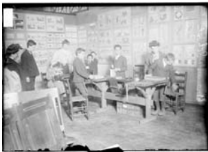
Grammar school children gathered around a table doing woodworking projects while teachers watch nearby in a classroom.