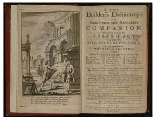
The Builder's Dictionary; or, Gentleman and Architect's Companion. The Builder's Dictionary Interactive at myLOC http://myloc.gov/Exhibitions/jeffersonslibrary/Imagination/ExhibitObjects/INT_BuildersDictionary.aspx

Standard 3. Effectively uses mental processes that are based on identifying similarities and differences.