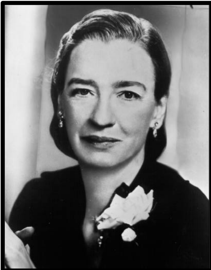
Grace Murray Hopper