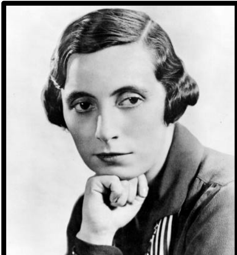
Anna M. Rosenberg