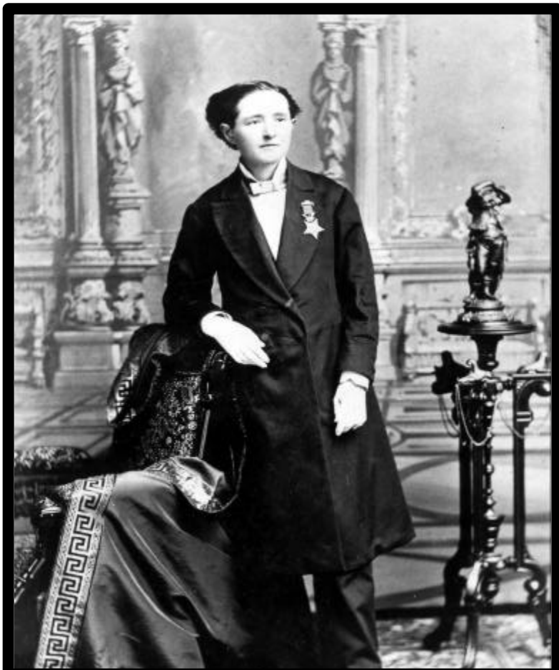
M a r y E d w a r d s W a l k e r

Photo: Courtesy Library of Congress Prints and Photographs Division, LC -USZ 62 -15558