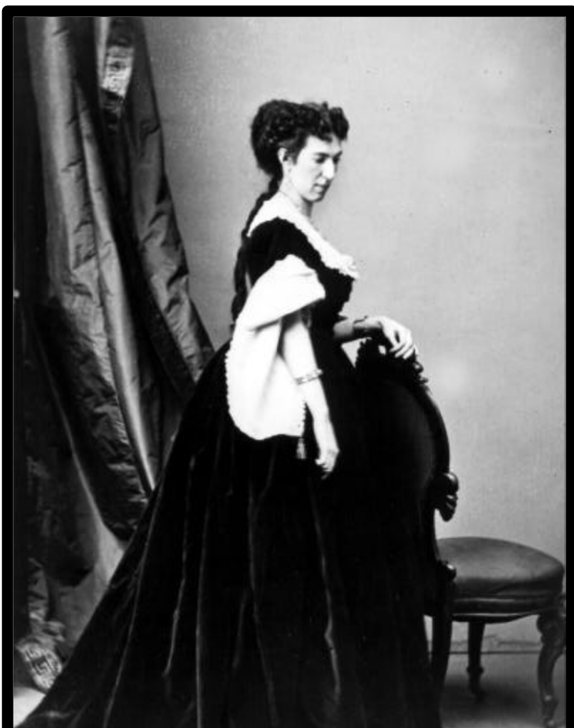
I s a b e l l e " B e l l e " B o y d

Photo: Courtesy Library of Congress Prints and Photographs Division, LC-BH82-4864A