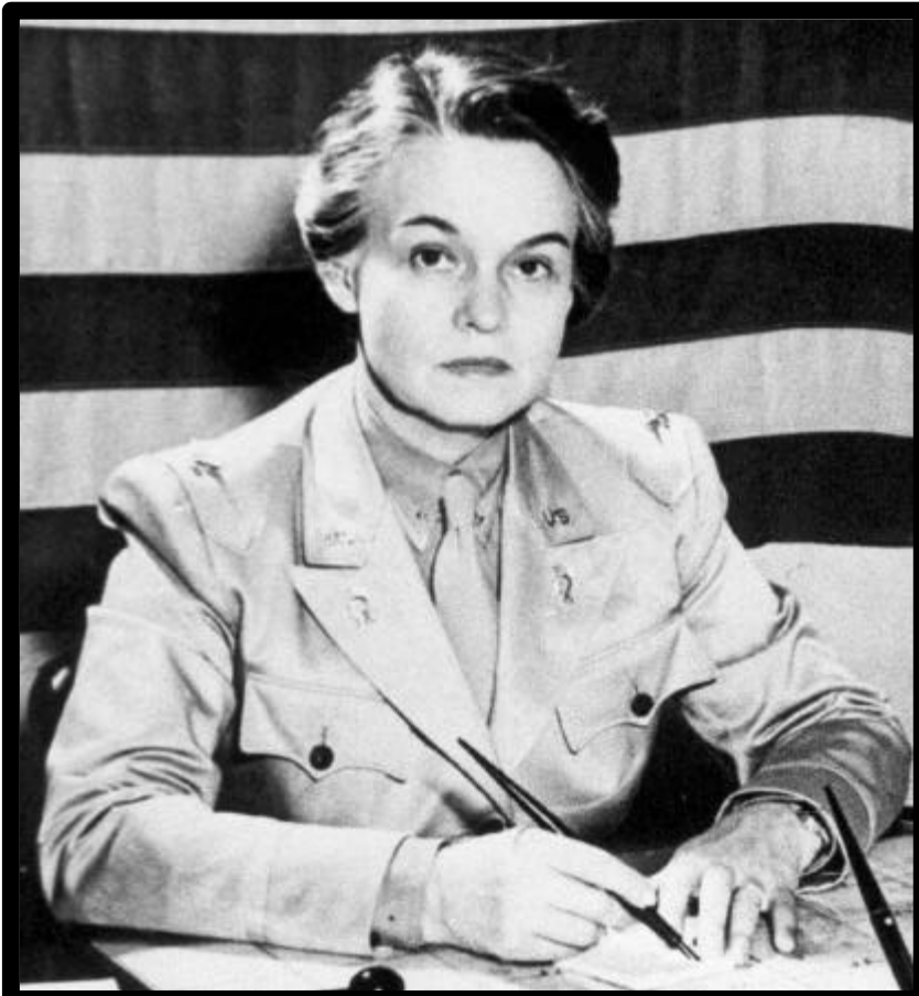
Oveta Culp Hobby