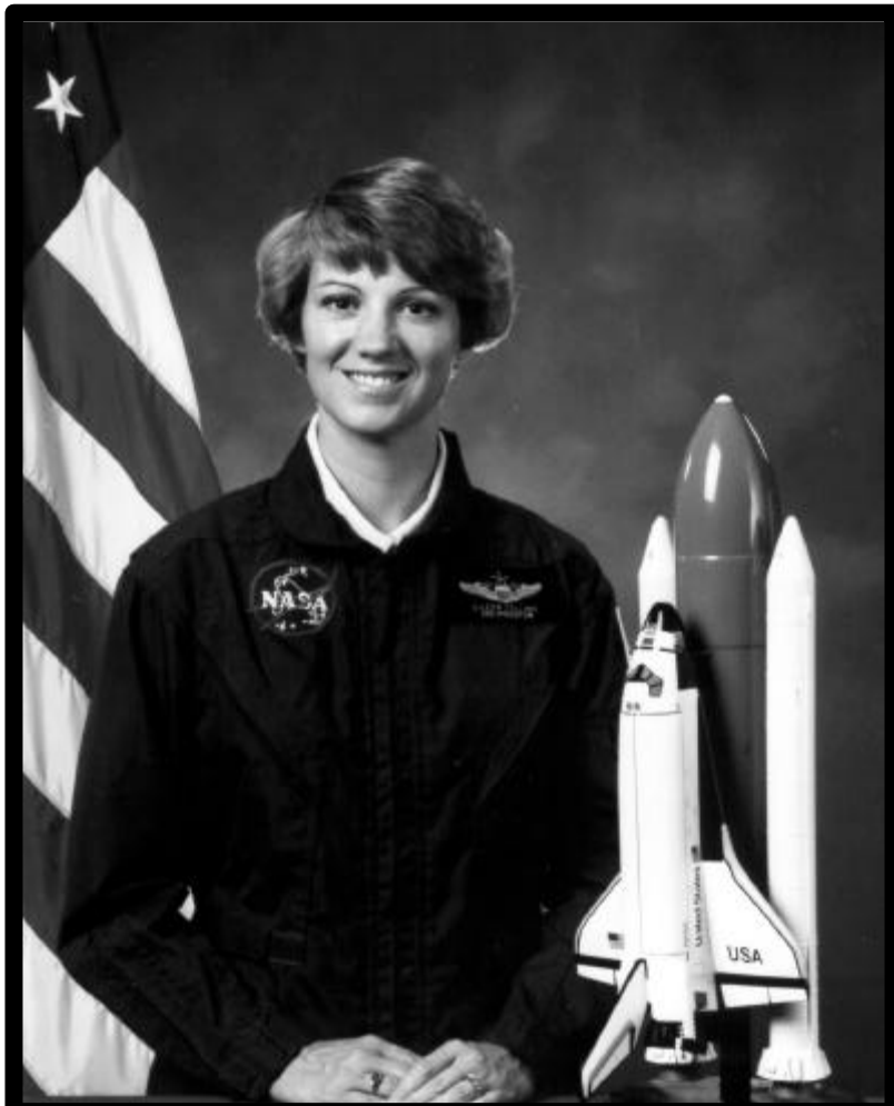
Eileen Marie Collins