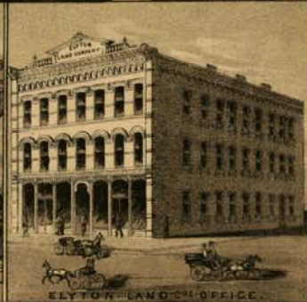
ELYTON LAND OFFICE.