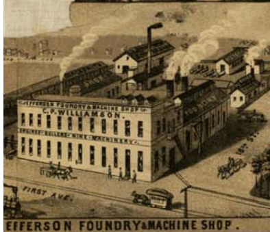
JEFFERSON FOUNDRY & MACHINE SHOP.