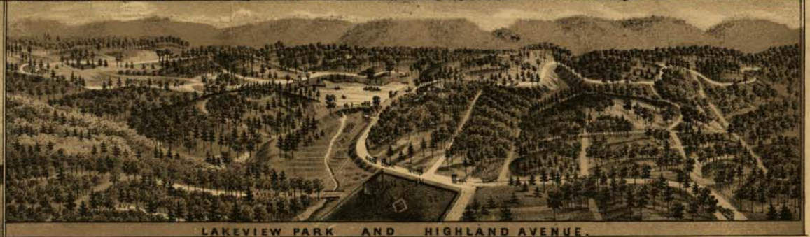
LAKEVIEW PARK AND HIGHLAND AVENUE.