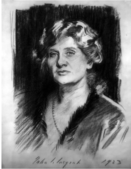
Elizabeth Sprague Coolidge by John Singer Sargent, 1923.

Your tax-deductible gift brings concerts to the community absolutely free to everyone and helps grow, advance, and make universally accessible the Library's unparalleled performing arts programs.