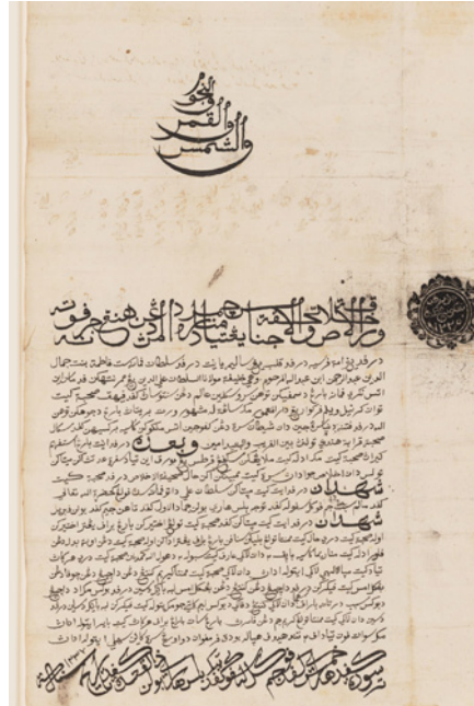
This rare 1822 letter from Sultanah Siti Fatimah binti Jamaluddin Abdul Rahman of Pammana to William Farquhar is one of the only extant Malay letters from a reigning woman monarch.

Letters in the collection speak to this dynamic, particularly one written by a prince whose throne had been usurped by his brother ( https://go.usa.gov/xsTTm ). The prince asks Farquhar for a loan – not the only time he had done so. A famous 19th-century Malay autobiography, the “Hikayat Abdullah” by Abdullah bin Abdul Kadir,