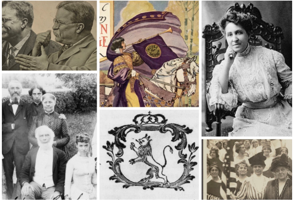
By the People launched campaigns in 2020 to transcribe original handwritten materials tied to Theodore Roosevelt (top left), Mary Church Terrell (top right), the Blackwell family (bottom left), women's suffrage (top center and bottom right) and historical Spanish legal documents (bottom center).