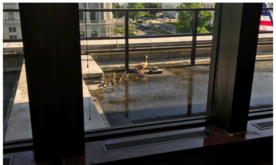
A mother duck and her ducklings seen outside the Madison Building’s sixth floor this week. The Humane Rescue Alliance has since removed the brood to the Capitol Reflecting Pool.