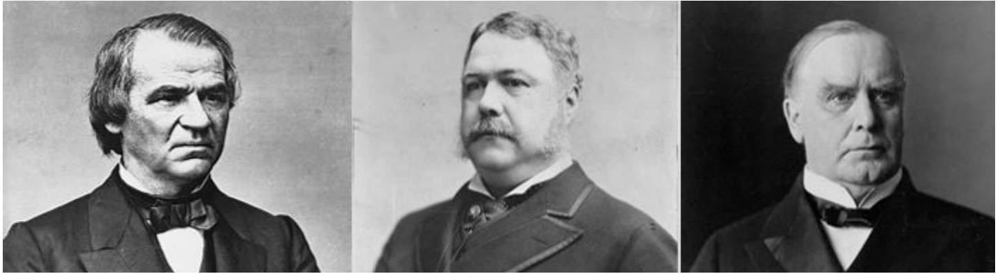
Andrew Johnson (from left), Chester Arthur and William McKinley.