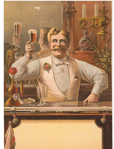
Prints and Photographs Division

We are also heavily involved with web archiving and have been adding content to four collections: "Business in America," "Economic Blogs," "Food and Foodways" and "Science Blogs" ( https://go.usa.gov/xfTsz ). ST&B also led the Earth Day 2020 web archiving project that commemorated the 50th anniversary of Earth Day as it was celebrated in the U.S. this year.